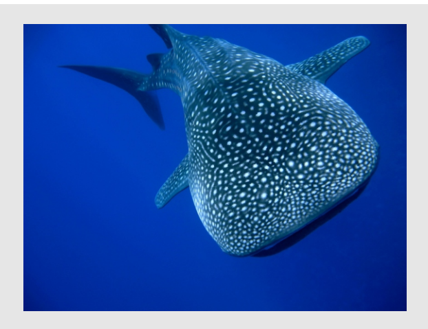
Interesting in the world of GIS...