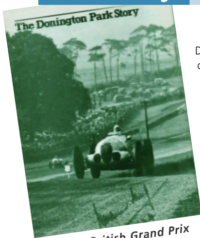
Figure 1: British Grand Prix 1937.